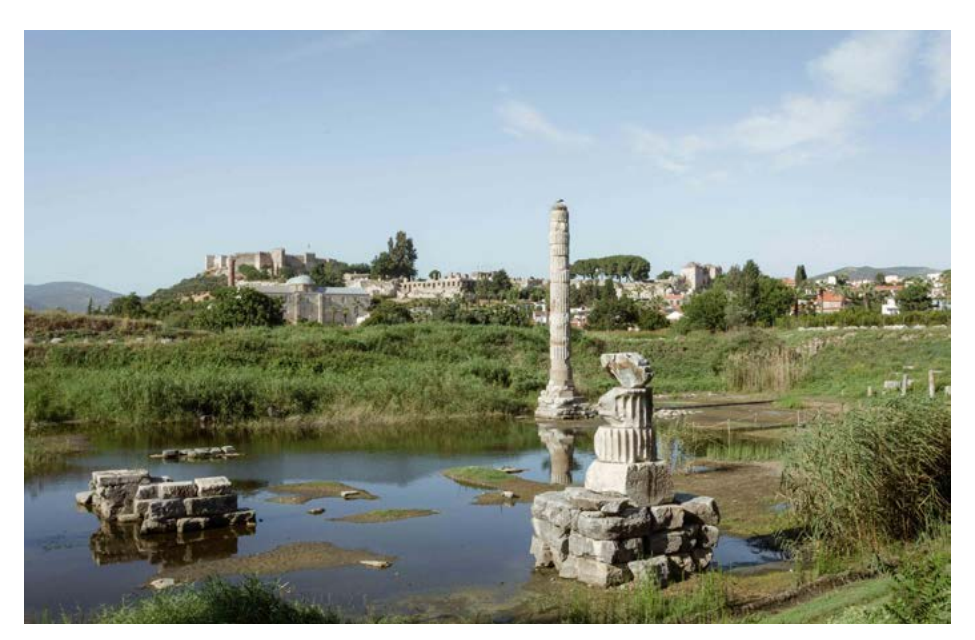
THE TEMPLE OF ARTEMIS AS IT STANDS TODAY